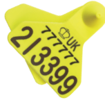
Z Tag Medium