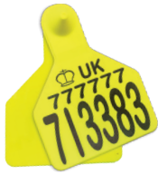
Z Tag Large